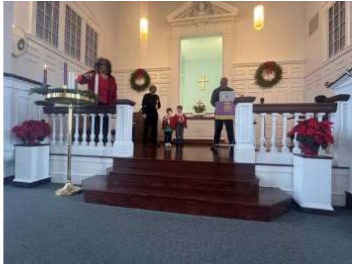
Third Sunday of Advent