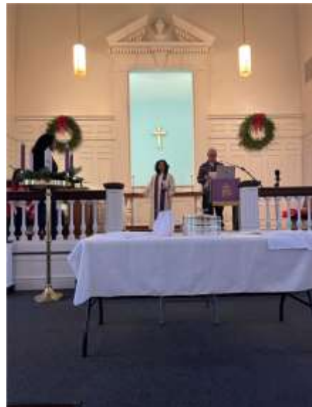
First Sunday of Advent