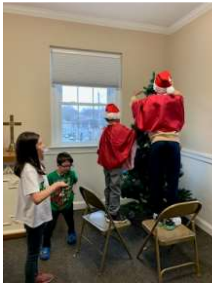
Sunday School Children getting ready for Christmas