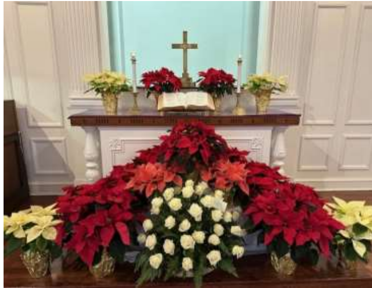
Advent Candle Lighting